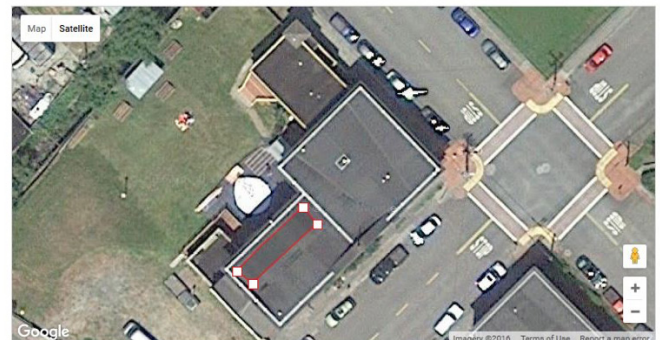
Screenshot of sample Google aerial image