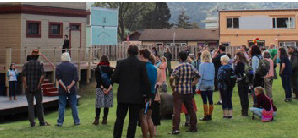
Left: The crowd gathering for the Solar Project Ribbon Cutting Ceremony at the Dell'Arte Annual Welcome Back Open House.