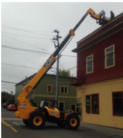
Right: A man-lift was rented to easily move materials to the roof of the facility.